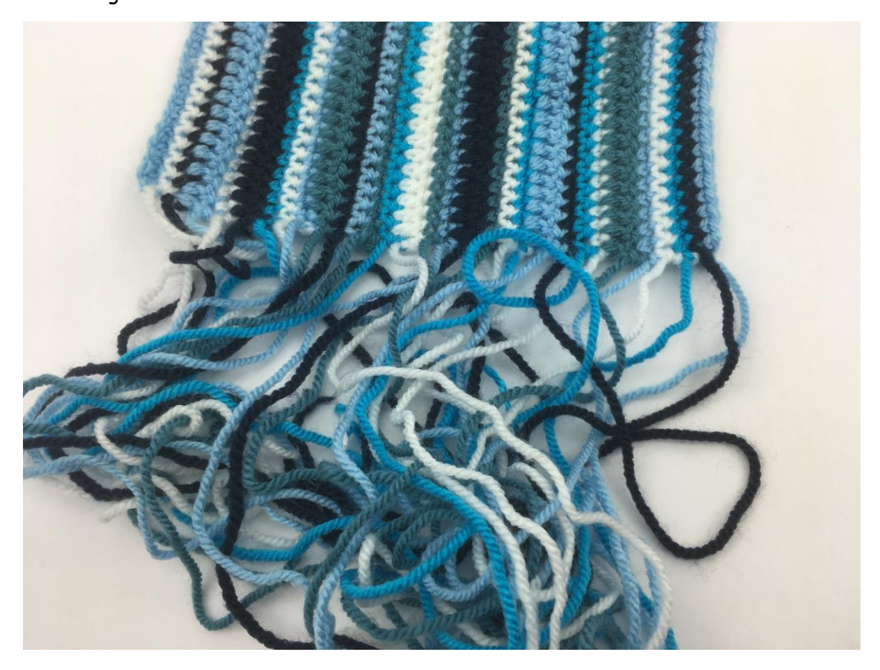
Finishing off. When you complete the last row the end of the scarf will look something like this...

Tease out all the ends until they are lying straight and cut them to six inches/15cms across.