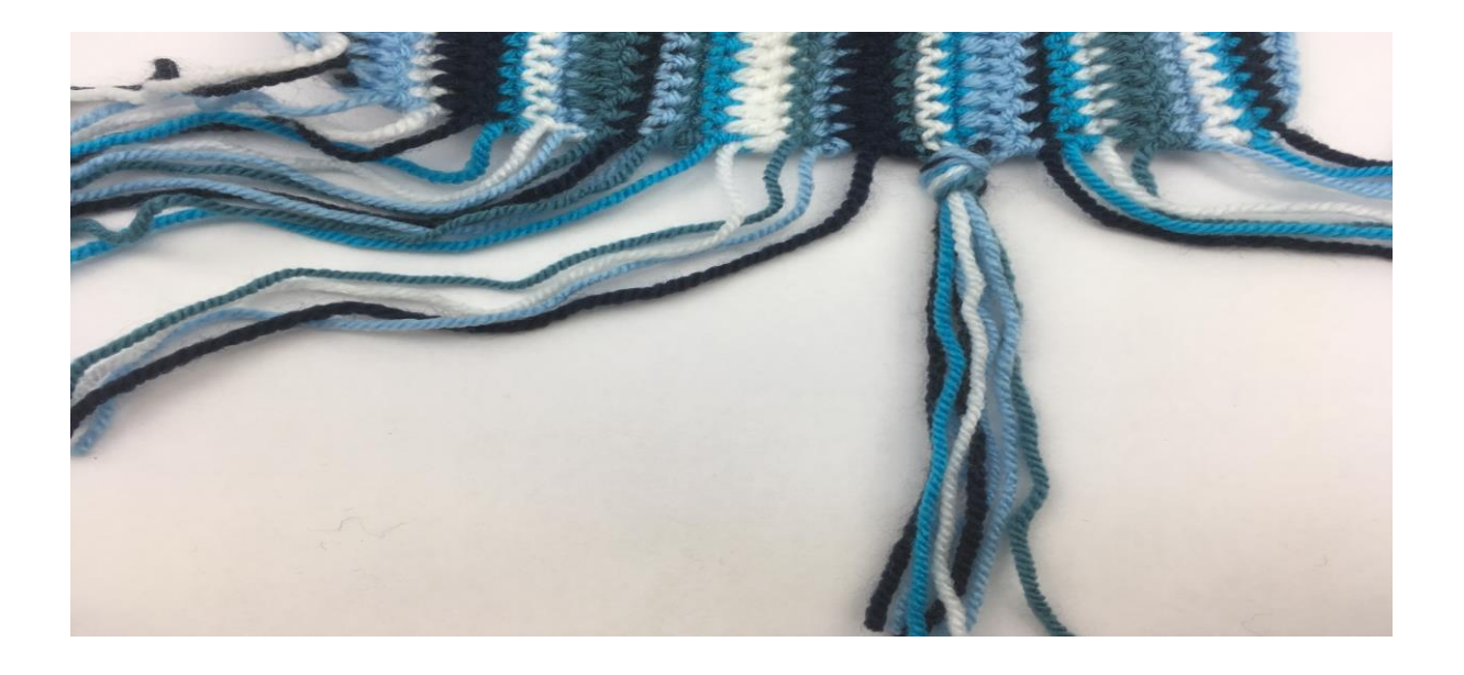
And you are done..... HAPPY CROCHETING \circledcirc

Tie into large knots pulled close to the edge of the work. There is no need to fasten any ends in on this project - the knots will keep these ends secure.